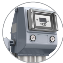
IP65 / Nema4