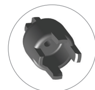
Optimised purge Nozzle

The compressed air quality is of vital importance in many applications even more so in breathing air applications. The applications, such as short-blasting, tank cleaning, tunneling, spray painting and many more require breathing air that is free from contaminants that may be present in the compressed air fed breathing air systems. These contaminants are present in the feed air in the form of fumes, oil, vapors, gases, solid particles and microorganisms.