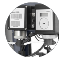
O 2 , CO & CO 2 sensors