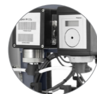
Gas Sensors (As sales options)