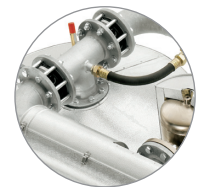
Purge nozzle optimization