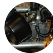
Inlet Blower Filters