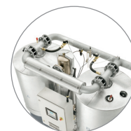
Reverse in and outlet pipe