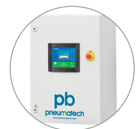
NEMA 4 electrical enclosure