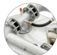
Purge nozzle optimization