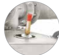
Vessel Safety valves