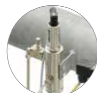
2nd PDP read out