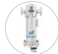
In and outlet filters